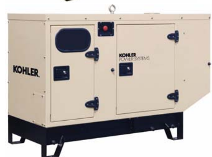
With Available Enclosure Accessory