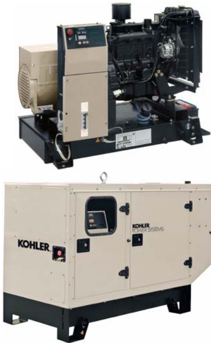
With Available Enclosure Accessory